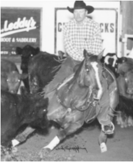
Dandyolena took home three championship titles at last year's event here.