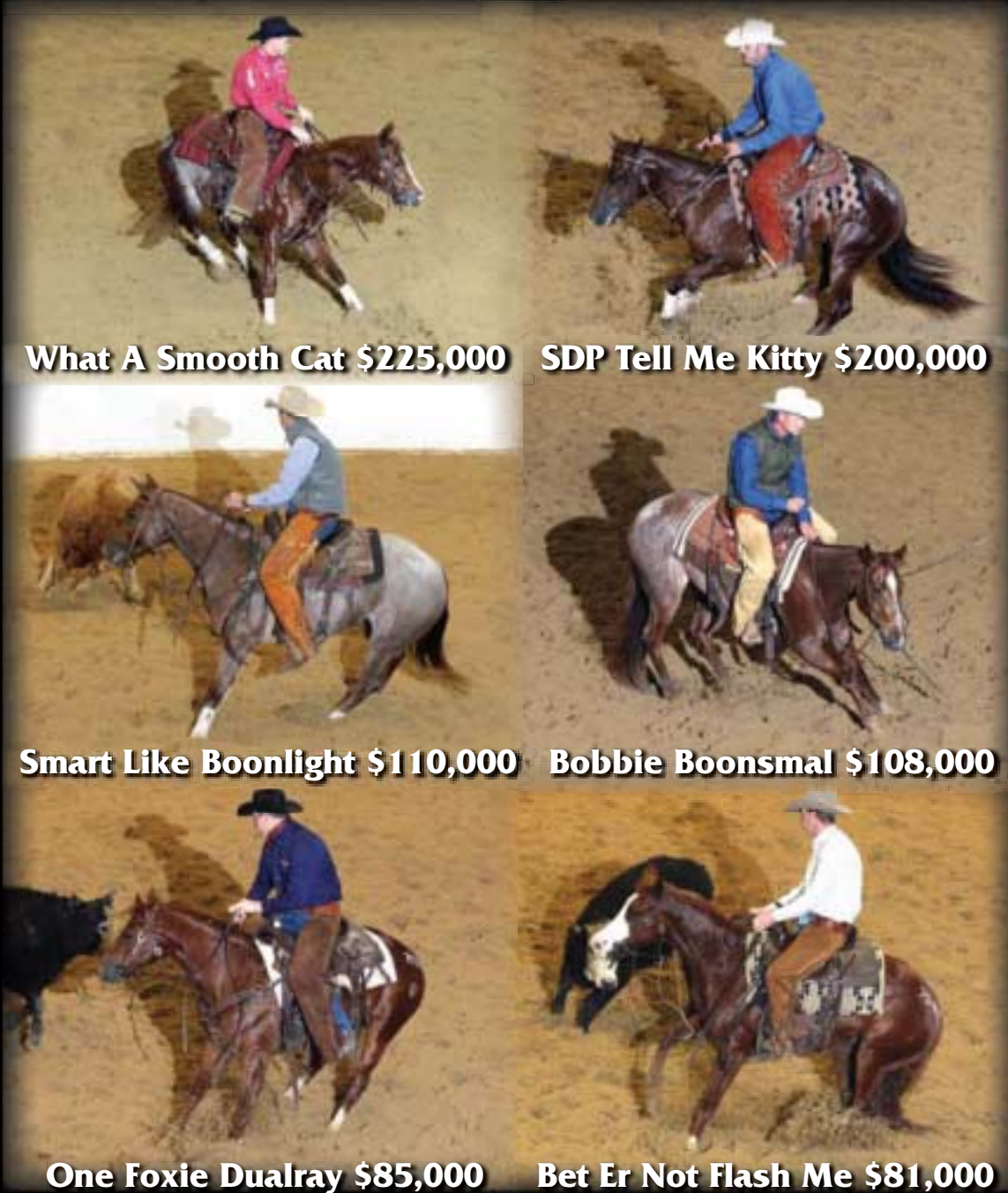
What A Smooth Cat $225,000