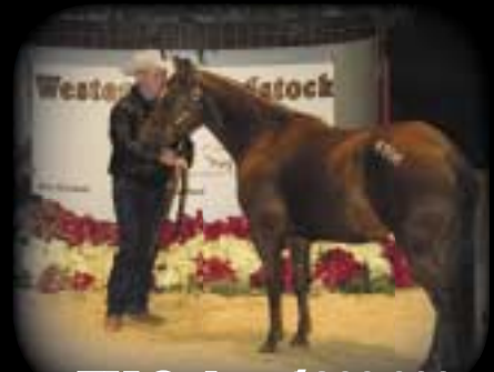
TM Quiver $200,000