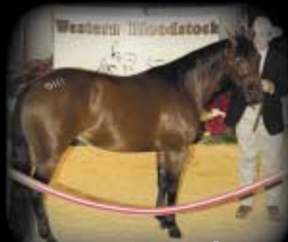
Shortys Starlight $172,000