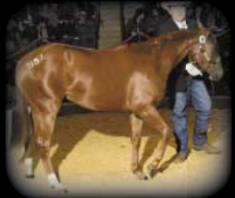
Peptos Stylish Miss $250,000 2005 High-Selling Yearling

In 2005... All 370 Select entries that actually sold averaged $25,327.