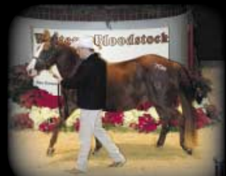
Smart Starlight $120,000