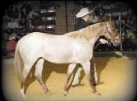
Punk Princess $70,000