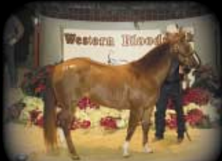
Zee Dually $225,000