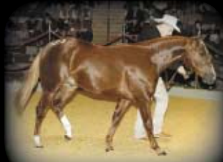
Cat And Dulce $100,000