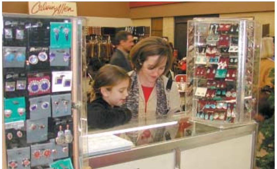
The Coors Light Western Mercantile was the number one place for wise Christmas shoppers this year.