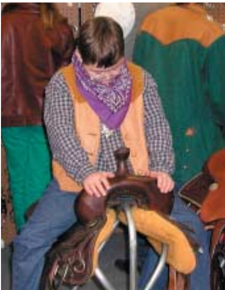
Saddles undergo intensive testing in Fort Worth.